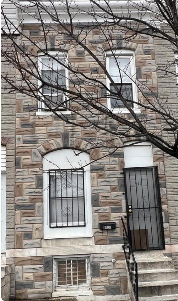
Childhood home in East Baltimore